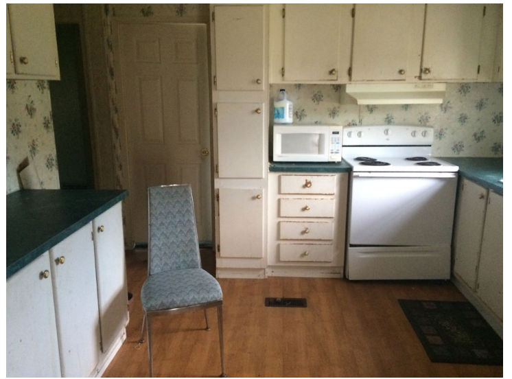
975 Mineral Springs – 3BR 2 BA 2,200SF